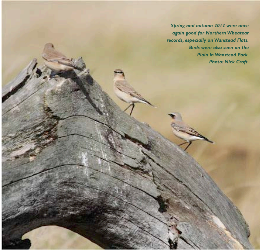
Spring and autumn 2012 were once again good for Northern Wheatear records, especially on Wanstead Flats. Birds were also seen on the Plain in Wanstead Park.